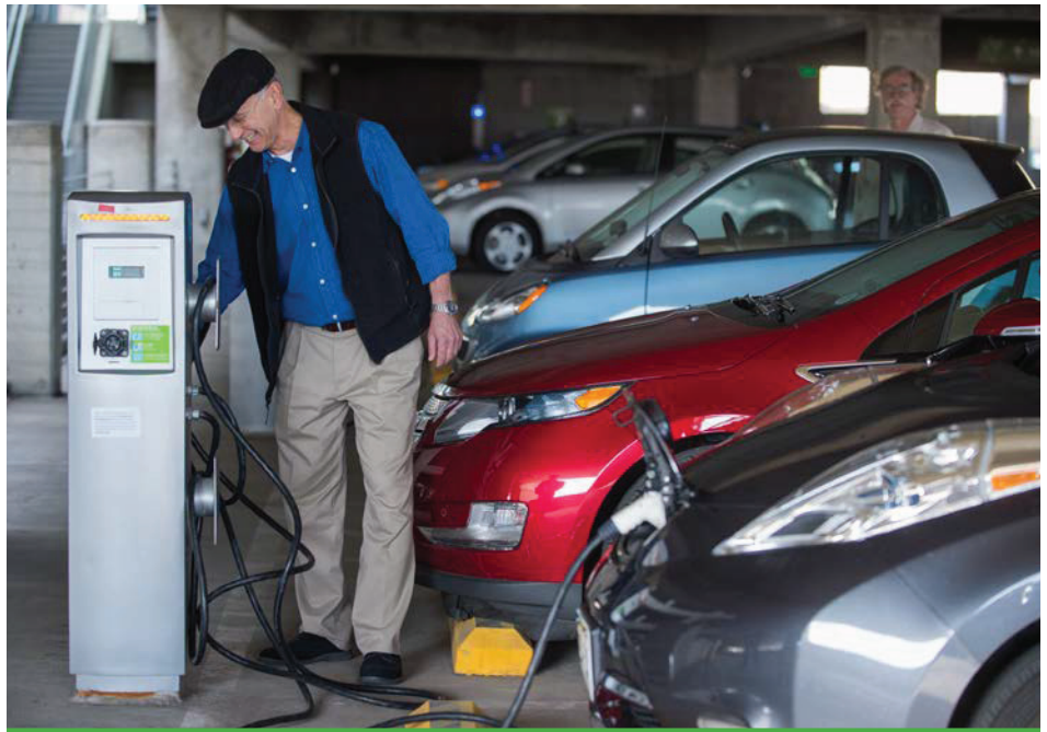
All-electric and plug-in hybrid electric vehicles are charged by plugging the vehicle in to an electric power source.

Regenerative braking allows HEVs, PHEVs, and EVs to capture energy normally lost during braking by using the electric motor as a generator and storing that captured energy in the battery.