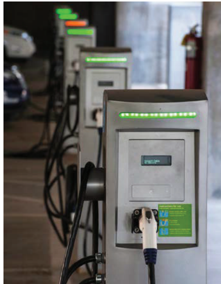
Drivers of EVs and PHEVs have access to thousands of charging stations across the country.

Today's EVs typically have shorter driving ranges per charge than conventional vehicles have per tank of gasoline. Most new EVs have ranges of about 100 miles on a fully charged battery, although an increasing number of models have ranges exceeding 200 miles. According to the U.S. Department of Transportation, 90% of all household vehicle trips in the United States cover less than 100 miles. 1 An EV's range varies according to driving conditions and driving habits. Extreme ambient temperatures tend to reduce range because energy from the battery must power climate control systems in addition to powering the motor. Speeding, aggressive driving, and heavy loads can also reduce range.