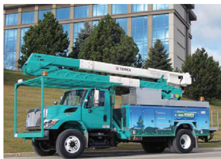
HEVs work well for both light-duty and heavy-duty applications, particularly those that require frequent stops and starts.

HEVs, PHEVs, and EVs undergo the same rigorous safety testing as conventional vehicles sold in the United States and must meet Federal Motor Vehicle Safety Standards. Battery packs meet rigorous testing standards, and vehicles are designed with insulated high-voltage lines and safety features that deactivate electric systems when they detect a collision or short circuit. For additional safety information, refer to the AFDC's Maintenance and Safety of Hybrid and Plug-In Electric Vehicles page ( afdc.energy.gov/vehicles/electric_maintenance.html ).